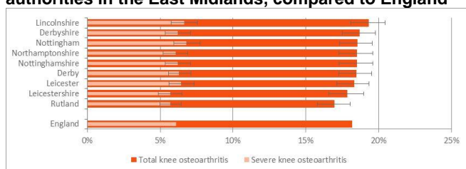
Figure 3. Osteoarthritis of the knee prevalence for local authorities in the East Midlands, compared to England

In 2011-12 there were 1,344 knee replacements (4 per 1000 people over 45 years) for people living in Lincolnshire at a cost of £8,461,839.