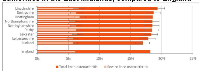
Figure 3. Osteoarthritis of the knee prevalence for local authorities in the East Midlands, compared to England

In 2011-12 there were 925 knee replacements (3 per 1000 people over 45 years) for people living in Northamptonshire at a cost of £5,811,290.