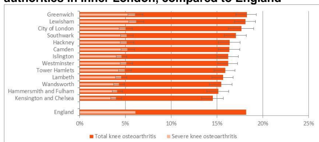
Figure 3. Osteoarthritis of the knee prevalence for local authorities in Inner London, compared to England

In 2011-12 there were 174 knee replacements (2 per 1000 people over 45 years) for people living in Southwark at a cost of £1,340,876.