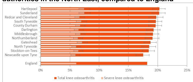
Figure 3. Osteoarthritis of the knee prevalence for local authorities in the North East, compared to England

In 2011-12 there were 572 knee replacements (5 per 1000 people over 45 years) for people living in Sunderland at a cost of £3,570,760.