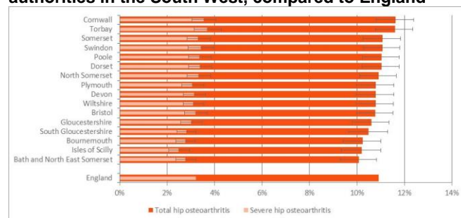
Figure 4. Osteoarthritis of the hip prevalence for local authorities in the South West, compared to England

In 2011-12 there were 372 hip replacements (4 per 1000 people over 45 years) for people living in North Somerset at a cost of £2,320,278.