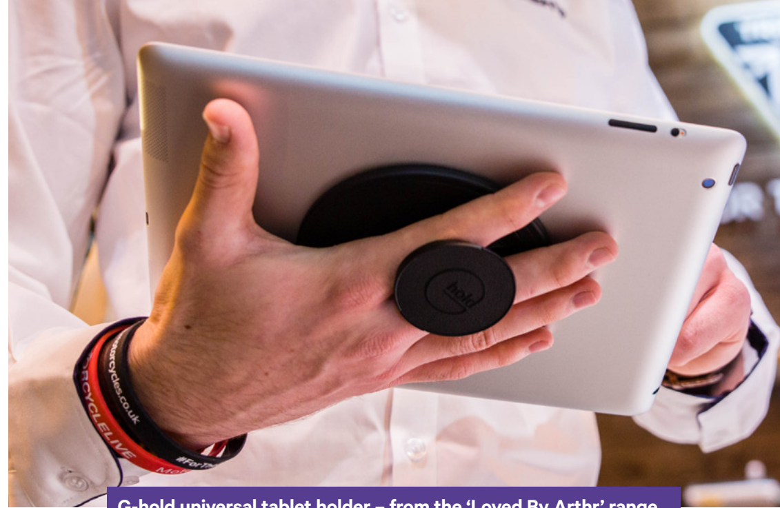
G-hold universal tablet holder – from the 'Loved By Arthr' range