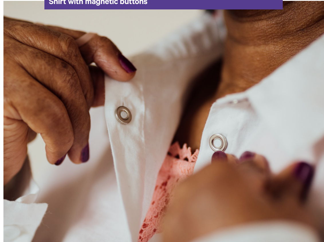
Shirt with magnetic buttons