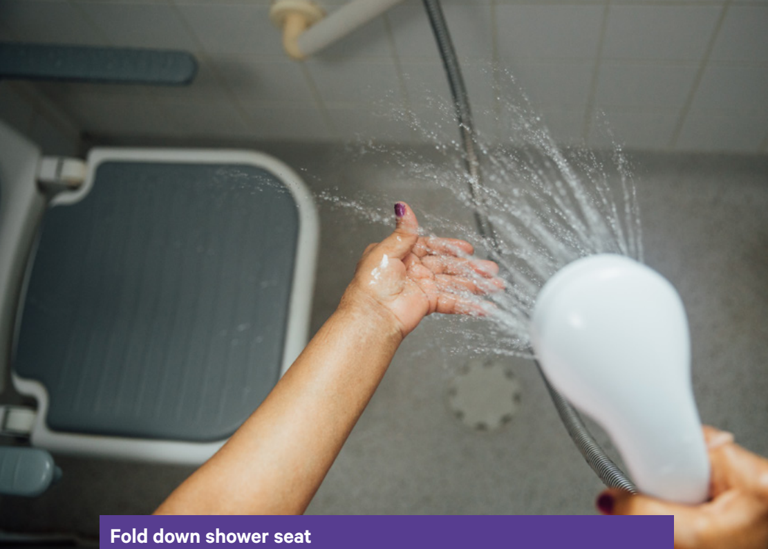
Fold down shower seat Toiler riser – from the Arthr product range