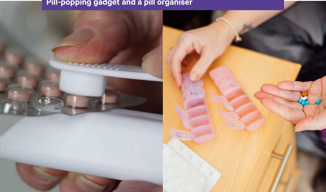
Pill-popping gadget and a pill organiser