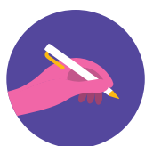
Table a written question or ask an oral question on our behalf.

If you live with arthritis in [name of constituency/region], @VersusArthritis offers a range of info and support services. Their helpline number is 0800 5200 520. Lots more info on their website: www.versusarthritis.org @CymruVArthritis