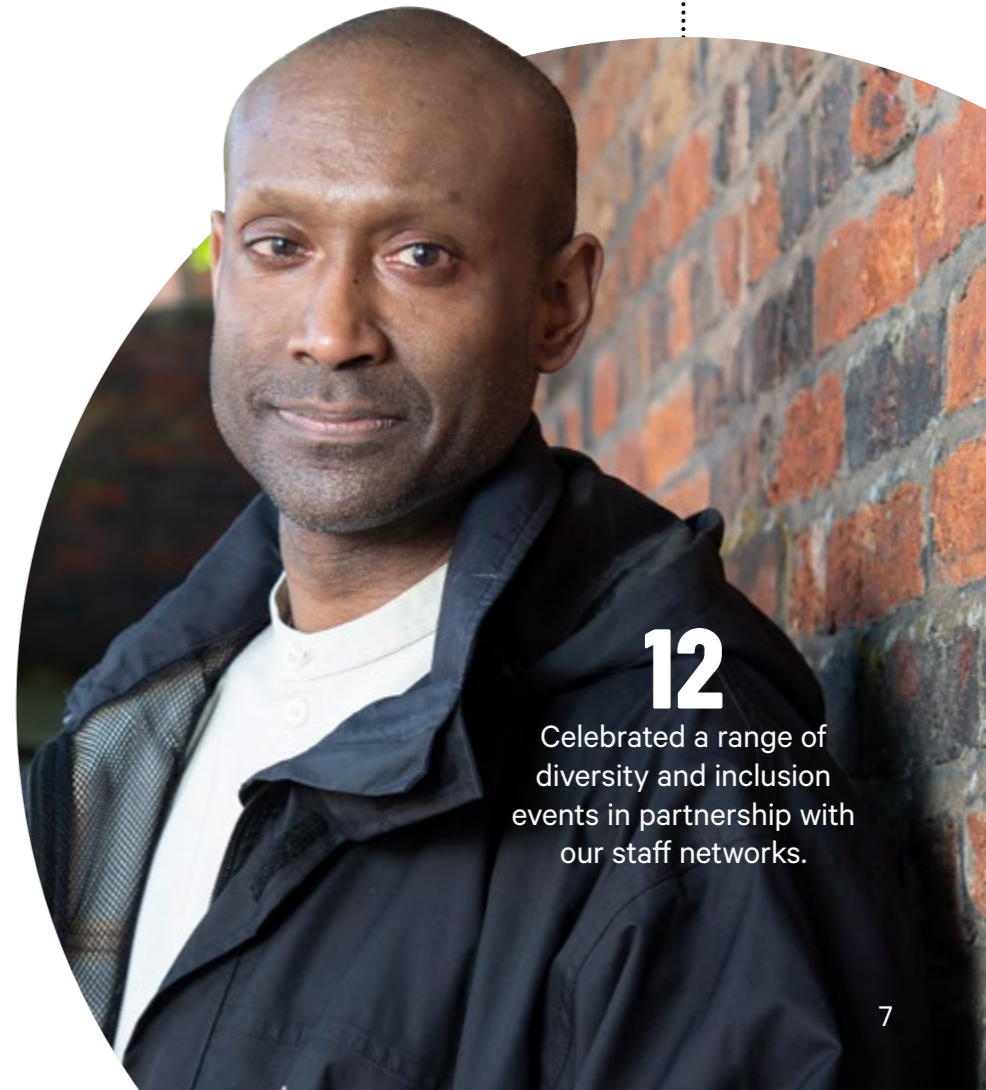
12 Celebrated a range of diversity and inclusion events in partnership with our staff networks.