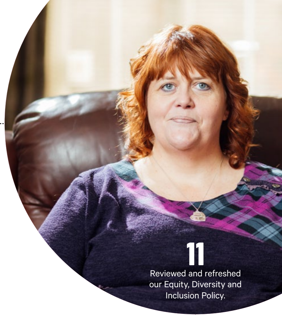
11 Reviewed and refreshed our Equity, Diversity and Inclusion Policy.