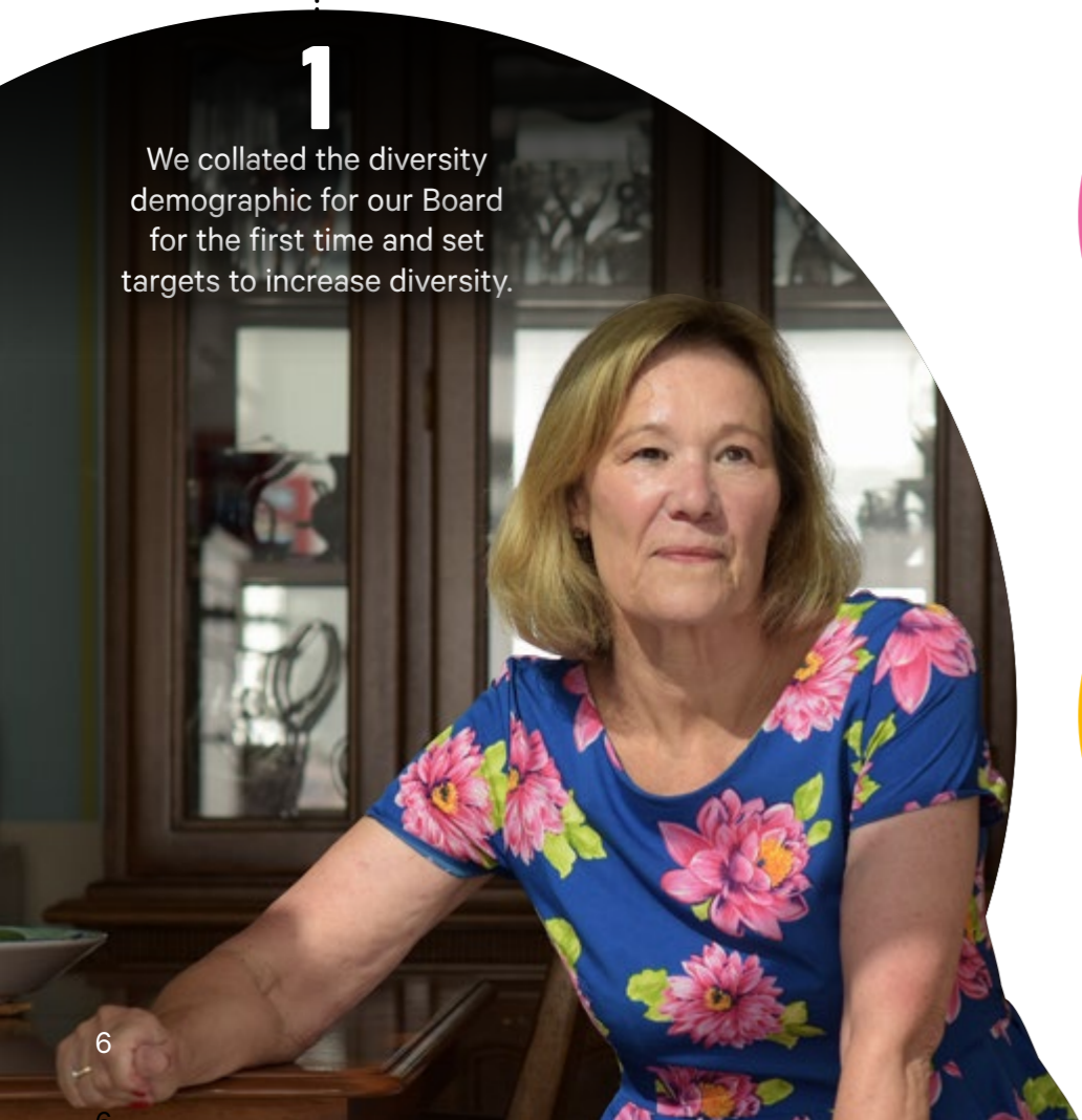
1 We collated the diversity demographic for our Board for the first time and set targets to increase diversity.