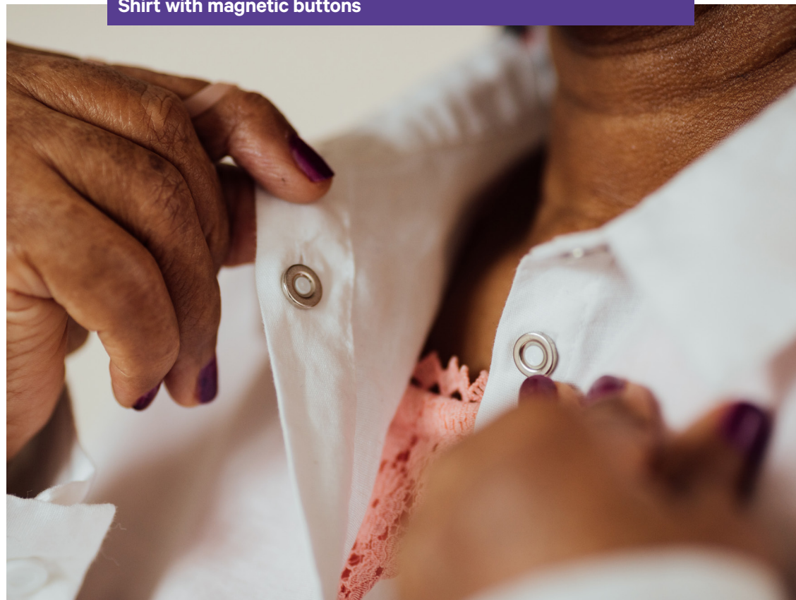
Shirt with magnetic buttons