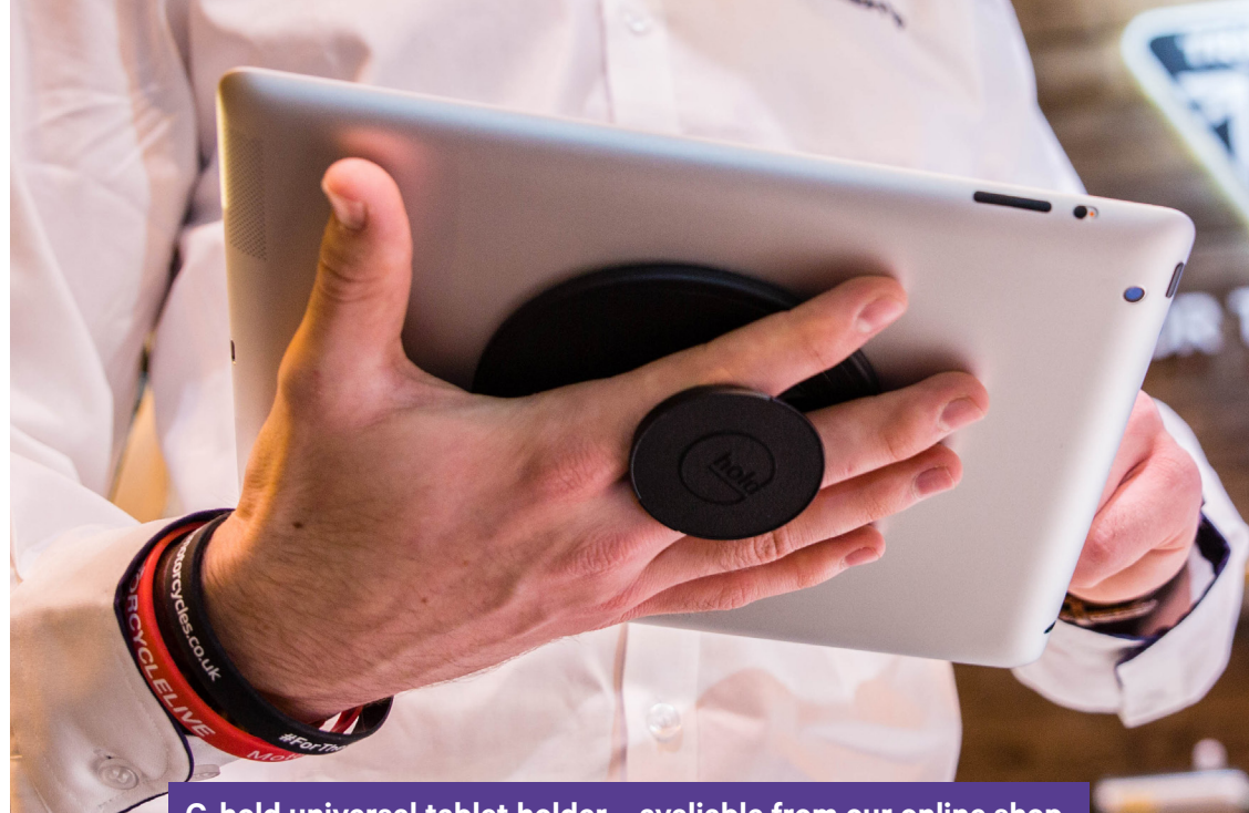
G-hold universal tablet holder – available from our online shop