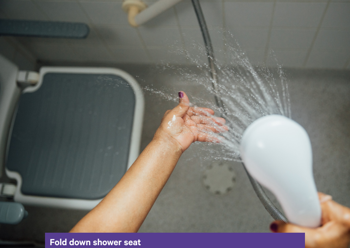
Fold down shower seat Toilet riser