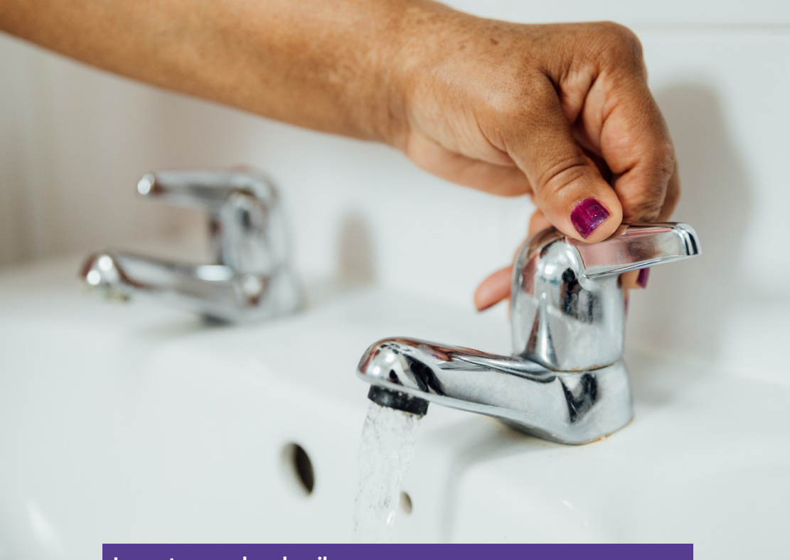
Lever taps and grab rail